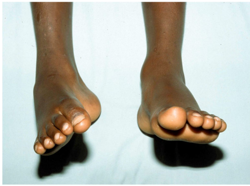
Fig. 3 Post-injection paralysis patient.

productivity of countries [22, 23]. In order to determine what resources are necessary to invest in to improve surgical care, quantitative assessments of the burden of disease in the