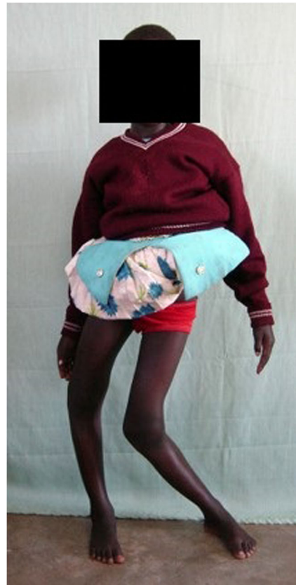
Fig. 6 Windswept knee deformity.

population are necessary. Prior studies have estimated surgical needs relying on the current procedures performed or survey