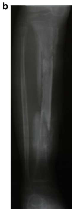
Fig. 4 a–b Lower extremity osteomyelitis patients.